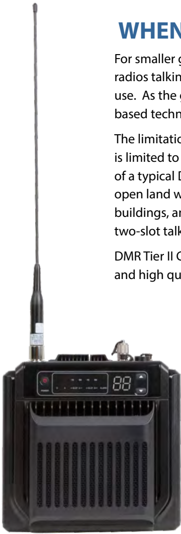
HR652 Compact Repeater

DMR Tier II Conventional Repeater systems are deployed to when the limited range, growing number of users, and high quantity of calls on radio-to-radio systems are limiting the organization's communications capacity.