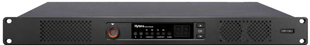
HR1062 Rack-Mount Repeater

Hytera repeaters are available as professional network equipment that can be installed in a standard 19" rack typically found in a data closet, and as compact repeaters that have integrated antennas for applications for use in tight spaces. Compact repeaters can also support portable applications with integrated battery packs for carrying the repeater in mobile applications.