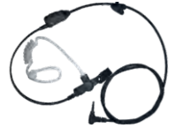
EAS07 Transparent Tube Earpiece with in-line PTT