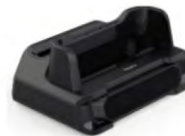
CH20L19 Desktop Charger