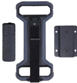
POA207 Protective Case with Hand Strap BRK37 Protective Case with Mounting Bracket BC39 Belt clip for use with POA207