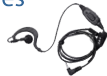
EHS24 C-Style 3.5mm Wired Earpiece with in-line PTT