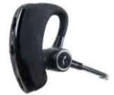
EHW08 Bluetooth Earpiece with PTT Button and Mic