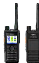
Hytera DMR Two-Way Radios