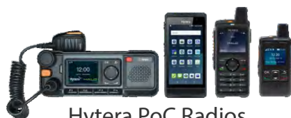
Hytera PoC Radios and Smart Devices