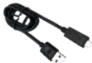
PC158 Charging Cable USB Type C