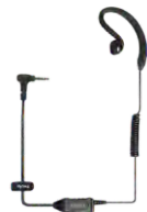
EHS30 Earpiece with in-line PTT & C-Earset