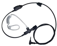
EAS07 Transparent Tube Earpiece with Push-to-Talk Mic