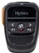
SM27W2 Bluetooth Speaker Microphone (IP67)