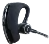
EHW08 Bluetooth Earpiece with PTT Button and Mic